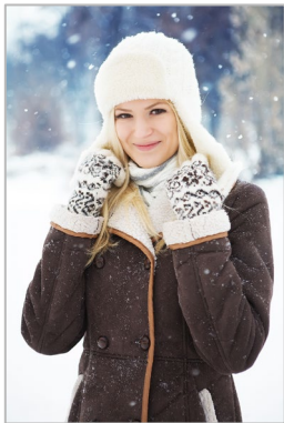
Alice $40,000 Income Age 30

Take a look at the example below. If Alice starts saving at age 30 and her investments grow at a rate of 6% a year, she winds up with over $238,000 more than she actually saved. Notice the curve of the green line – the longer she saves, the faster her account increases.